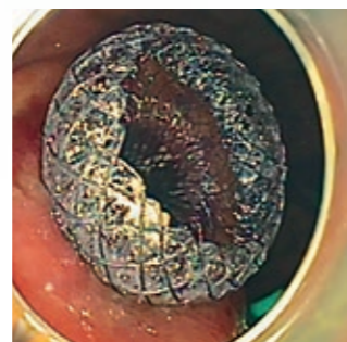
Transgastric access from stomach into pseudocyst