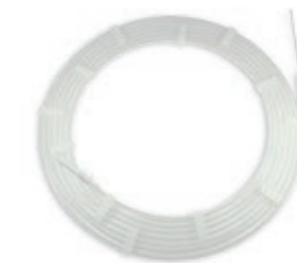
Dispenser guide wires

The wire can be easily ejected and retracted by means of this innovative dispenser. Owing to its compact design, the dispenser is handy and easy to operate. Rinsing the wire is also easy and fast when using the dispenser.